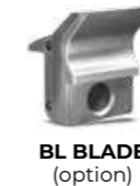
BL BLADE (option)