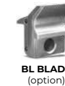
BL BLADE (option)