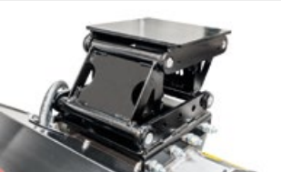
Attachment plate with self levelling device to adapt to all types of terrain