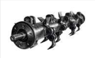
Possibility to have the rotor equipped with PML hammers or Y-flail