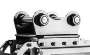
Customized attachment bracket