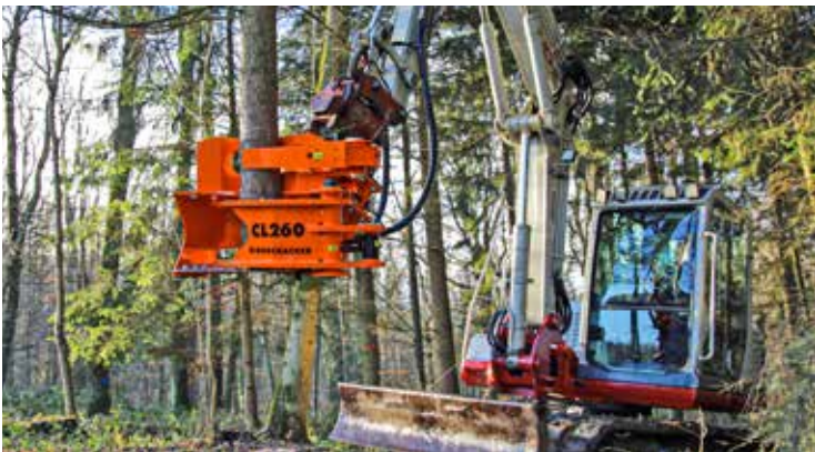
Optional available with accumulator.