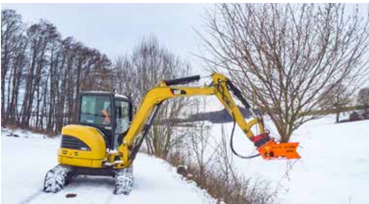
For mini excavators from 2,5t.