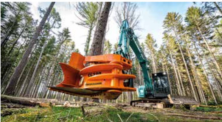
Fast harvest of small trees and bushes.