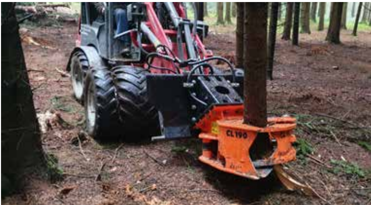
Woodcracker® CL cuts weak wood up to 40 cm.